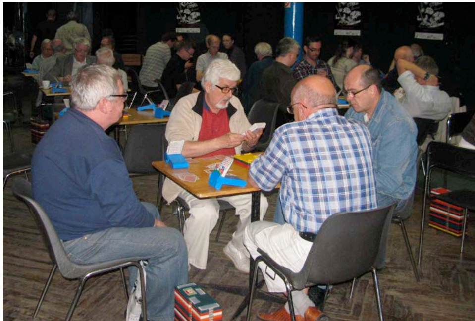
The bridge club in Krakow