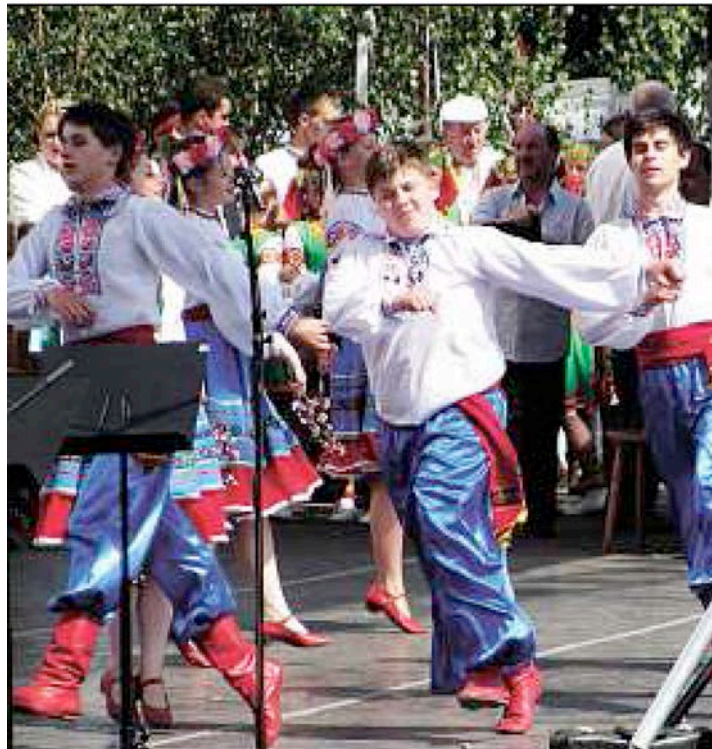
At a Lemko folk festival

Our slide continued two rounds later when we played against one of the few women in the field. By my count, there were five female players out of a field of 94!