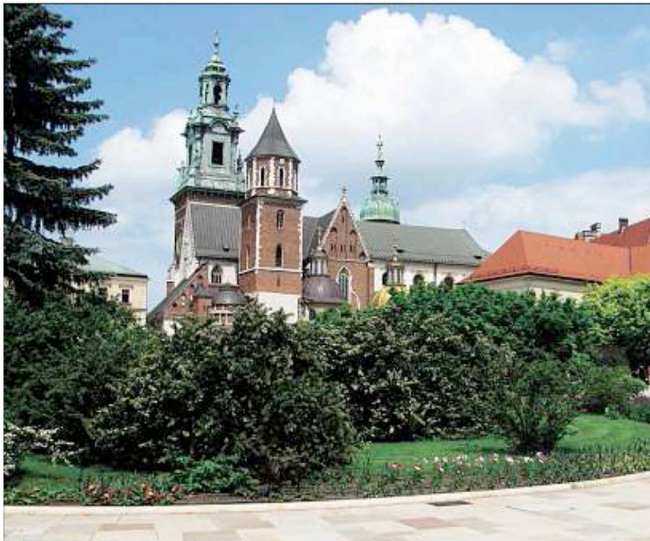
Wawel Cathedral in Krakow